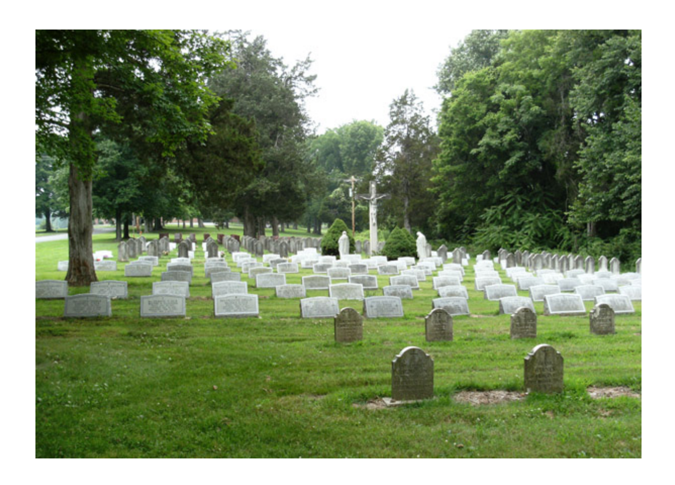
Redemptorist Cemetery, Liguori, Jefferson County, Missouri